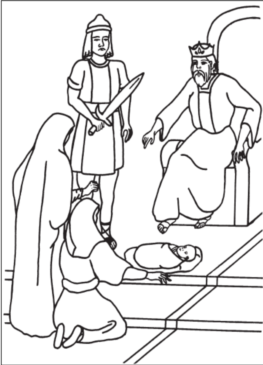
Solomon decides who the real mother of the child.